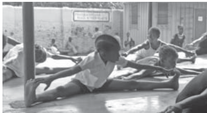
Dance programme at St. Anne's Primary School

Also through the “replication project”, JSH approached another school, Whitfield All Ages School and instituted a cooperative play programme at that school. JSH then approached Tavares Gardens Primary School , and worked with the principal to identify a suitable programme to improve attendance of its student population of 250. Using the successful model of St. Peter Claver Primary School, JSH agreed to fund a small music project: recorder classes for students in Grades 3 to 5. The programme was initiated in early 2008, and to date appears to be a positive addition to the school.