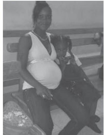
S-Corner Clinic assists women & children

Down the street S-Corner Clinic and Community Development Organization encountered a number of challenges over the year as they coped with several outbreaks of violence in the community. They shifted some programmes to better address community needs and to keep staff and volunteers safe. They continued to offer innovative activities that defied the fear created by gang activity, and maintained hope for the larger community. Health education, youth programmes, peace building activities and grief counselling, and parenting sessions assisted over 3000 people in the Bennet Lands area.