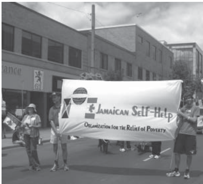
Canada Day Parade in Peterborough