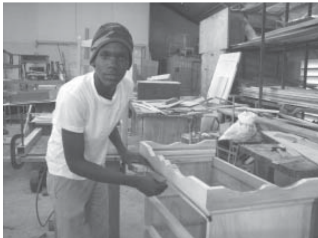
Woodworking at St. Margaret's Centre

“Youth, Education & Leadership” - April 2007 ~ March 2008