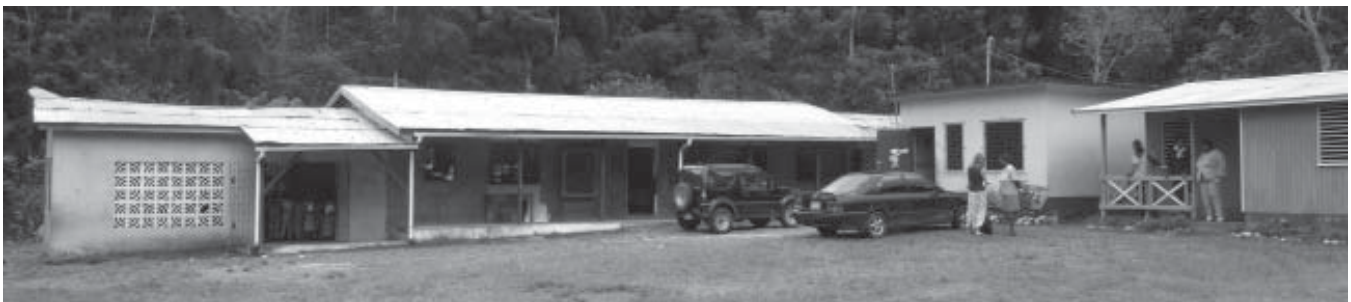
Mount Joseph Primary School