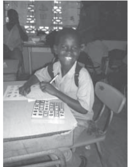
St Theresa's Literacy Project